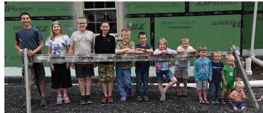
All of the builder kids, lined up from oldest to youngest.